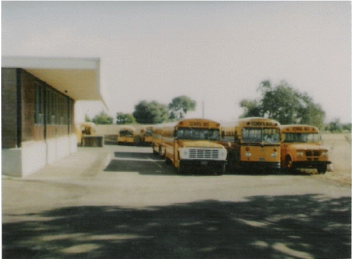
Bus Parking Yard in 1982